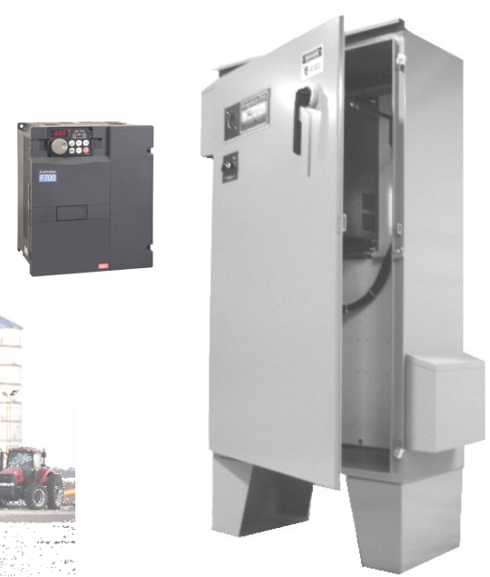
UL Approved Panels

The Industry's Best Tech Support at No Charge